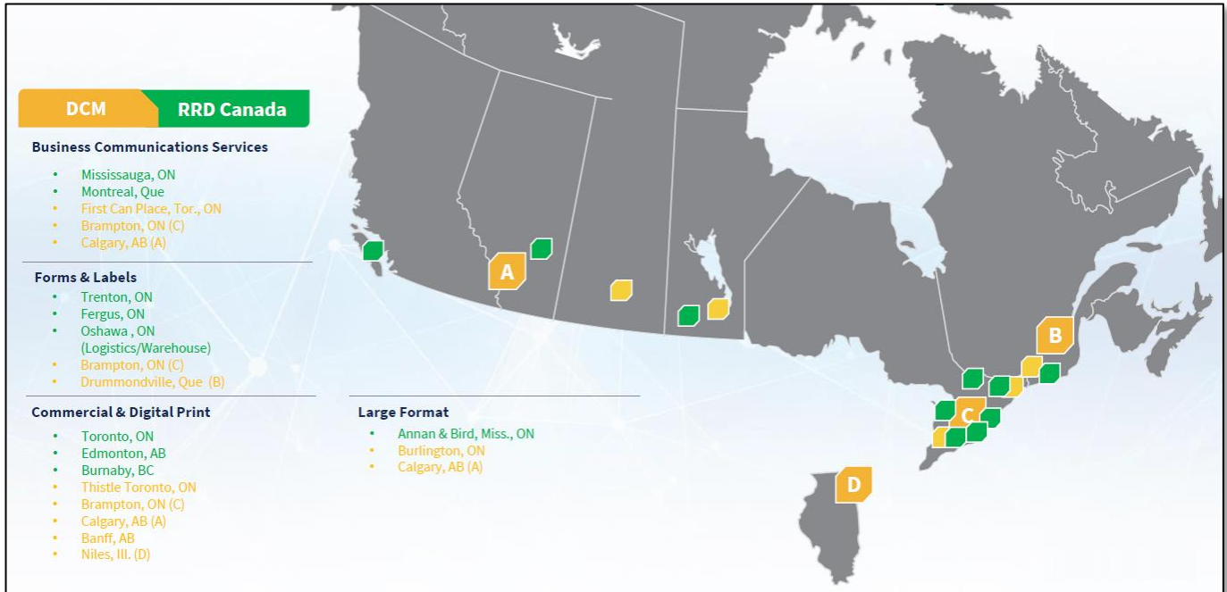
Figure 1: DCM and RRD Canada – National Reach & Capabilities