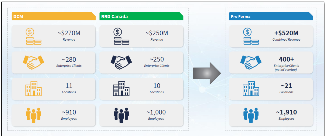
Figure 2: DCM and RRD Canada – Pro Forma